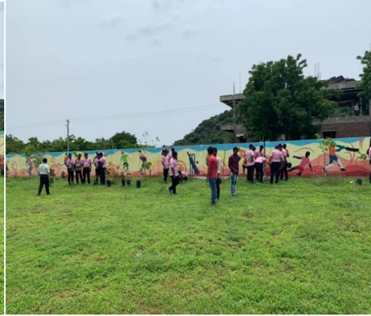
(Faculty, volunteers, B. Tech students, Chalapathi Institute of Technology)