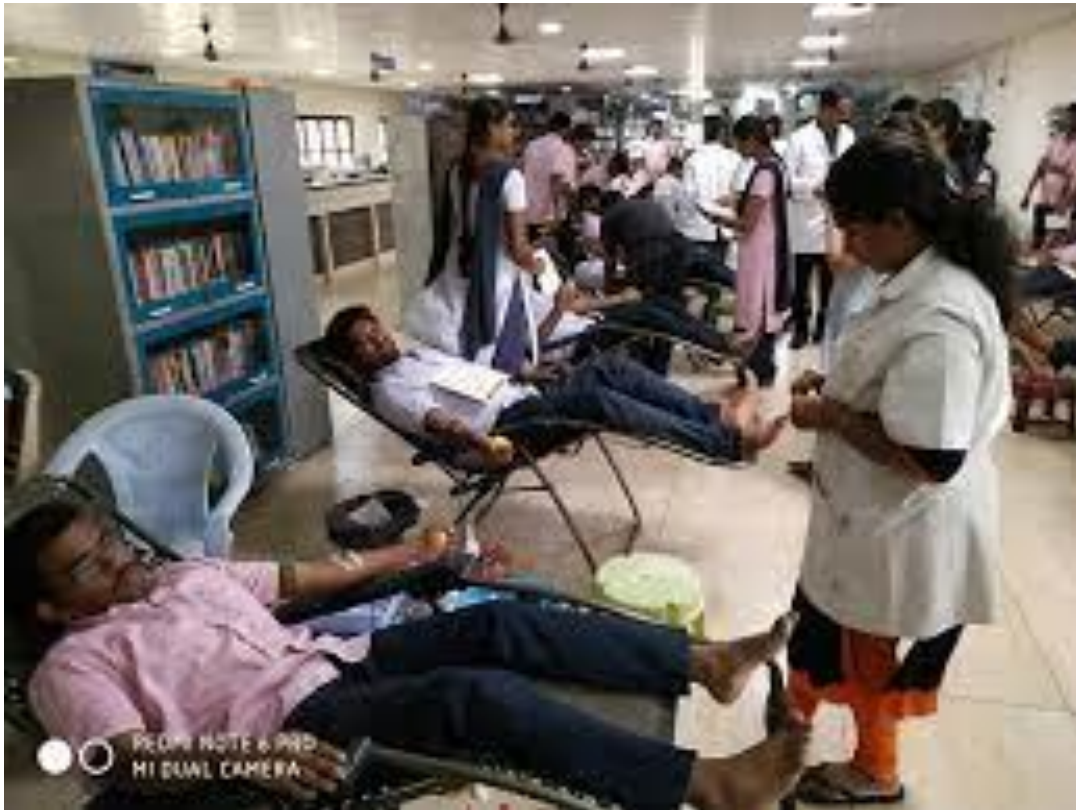
(blood donated by chalapathi institute of technology students)