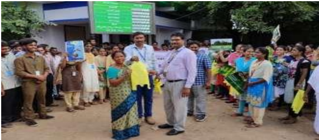
(Faculty, volunteers, B. Tech students, Chalapathi Institute of Technology)