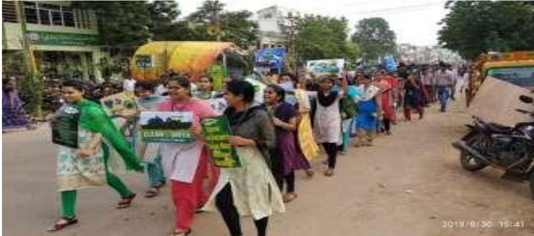
(volunteers, B. Tech students, Chalapathi Institute of Technology)