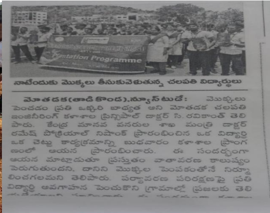
(Faculty, volunteers, B. Tech students, Chalapathi Institute of Technology)